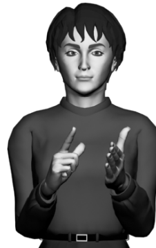
ILLEGAL (part 1)