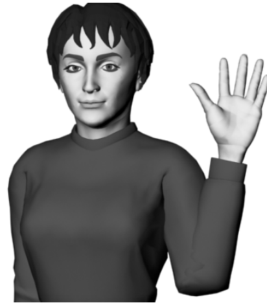
FIGURE 1: Human Model for Displaying ASL

The display portion of our system is a database-driven graphic package generating ASL phrases using a human model [17][18][19][20]. The database contains information about the model's hand shapes, hand locations and timing, as well as facial information and other non-manual sign components. The graphics engine we use is a widely available commercial product. Our human digital model, shown in Figure 1, is used to generate ASL animations in a natural and recognizable way.