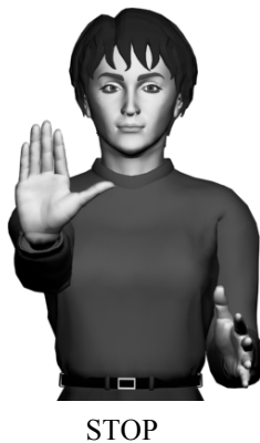
FIGURE 3: An ASL Sign for STOP.

After the passenger has passed through the metal detector, there will be a third monitor to provide further instructions. The default, assuming that no metal was detected, is a loop indicating that the passenger should pick up carry-on items and proceed to the gate. If the alarm sounds, the monitor immediately displays an ASL sign for “stop”. See Figure 3. While there are other ASL signs for this word, this one is the most universally understood. The monitor will also flash as the sign is displayed. At this point the guard may ask the passenger to remove any remaining metal, and step back through the detector. The relevant vocabulary for this step is listed in Table 3, and frames from one of the animations are displayed in Figure 4.