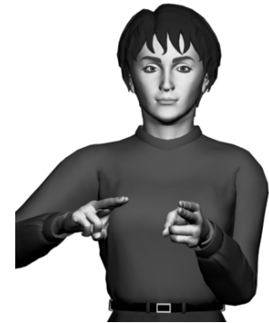
KNIFE (part 2)