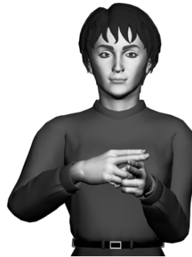
KNIFE (part 1)