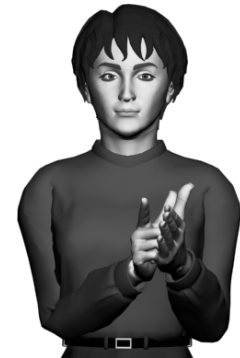
ILLEGAL (part 2)